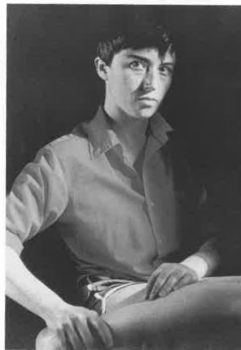
Cindy Sherman, Untitled , 1982 (photo courtesy Metro Pictures, New York).