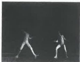
Jack Goldstein, Two Fencers , Salle Patino, Geneva, 1977.

ment. This notion of presence is what we mean when we say, for example, that Laurie Anderson is a performer with presence. We mean by such a statement not simply that she is there, in front of us, but that she is more than there, that in addition to being there, she has presence. If we think of Laurie Anderson in this way, it might seem a bit odd, because Laurie Anderson's particular presence is effected through the use of reproductive technologies that really make her quite absent, or only there as the kind of presence that Henry James meant when he said, "The presence before him was a presence."